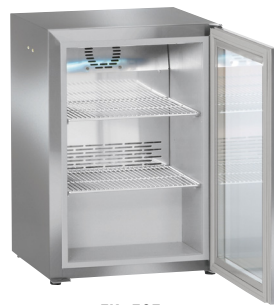
FKv 503 Premium