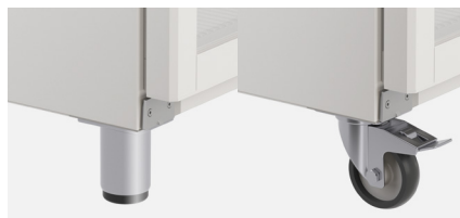
Adjustable feet and castors Choose between castors or feet that are simple to fit, and that make the appliance easy to transport and to be cleaned under.