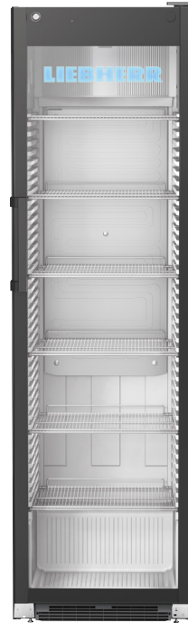
FKDv 4523 PremiumPlus