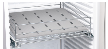
Gravity feed shelf for bottles Beverages are easy to access and always within reach; can be removed from telescopic rails for restocking.