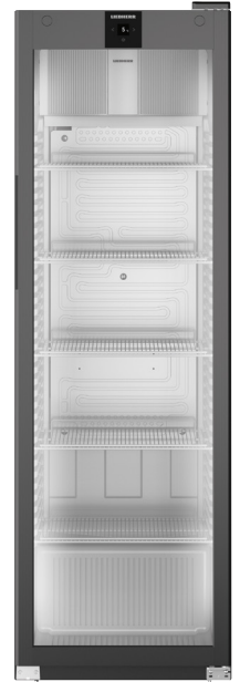
MRFvg 4011 Perfection