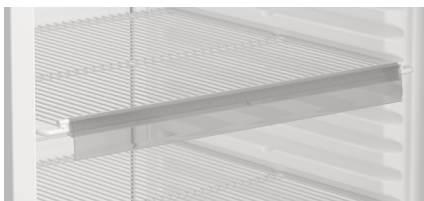
Scanner rail Rails can be attached to the shelf for price tags, bar or QR codes or individual POS messages.