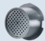
Activated Charcoal Filter Part no.: 3988129100

° = Measurements taken at +25°C ambient and +12°C interior temperature tested by Liebherr Germany (not to Australian standards).