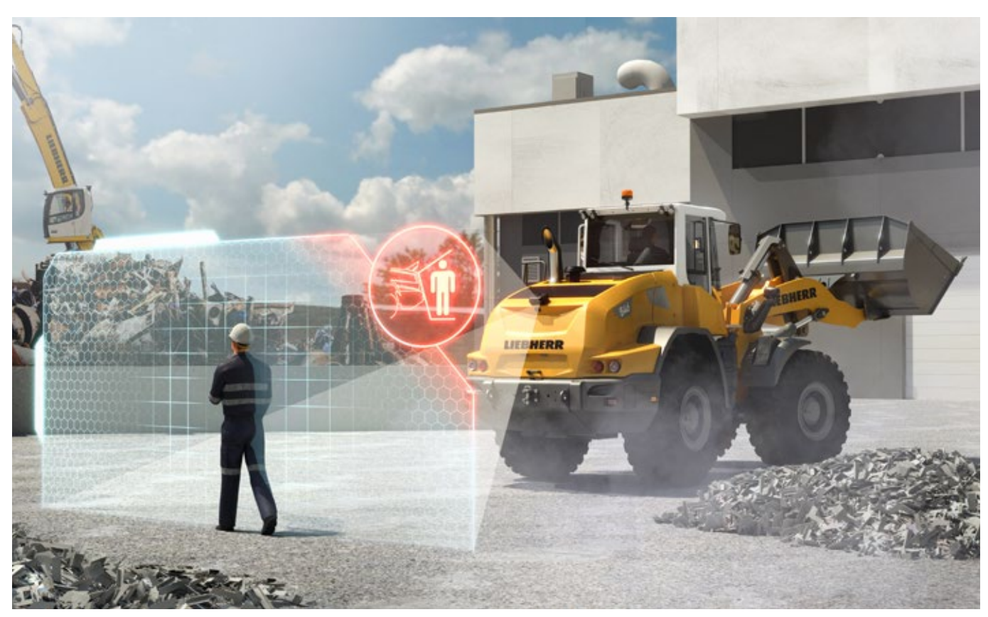
Rear personnel detection with automatic braking has already won many industry awards, such as the VDBUM sponsorship prize for 2022.

The active personnel detection option with brake assistant is a warning system developed by Liebherr for wheel loaders. Safe operation of the machine without accidents is the responsibility of the wheel loader driver and the operator of the site.