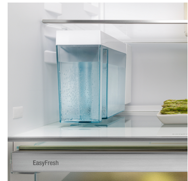
IceMaker with water tank

The rear wall in elegant SmartSteel gives your Liebherr a stylish look and feel. Your food will also love SmartSteel as stainless steel is food-safe and hygienic. SmartSteel also reduces the visibility of fingerprints – making the appearance even more pleasing.