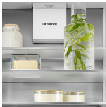
SmartSteel rear wall

Fingertip control: the touch display enables easy and intuitive operation of your Liebherr. All functions are clearly arranged on the display. By gently tapping a finger, for example, you can easily select the functions or check the current temperature of your refrigerator.