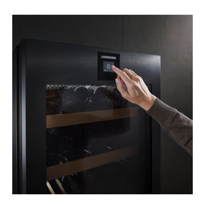
Precision temperature settings

To ensure that your wine can mature in optimum air quality, all Liebherr wine tempering fridges have an activated charcoal filter that reliably binds odours of all kinds. This means your wine will keep its pure bouquet. To make sure that it stays that way, your Liebherr reminds you every 6 months to change the filter, which you can easily do yourself.