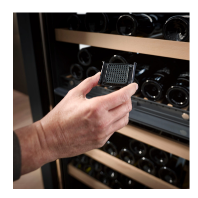
FreshAir charcoal filter

Triple protection. The wine tempering fridges with glass door offer unprecedented protection from UV radiation: three protective layers consisting of tinted glass and a double layer of vacuum-deposited metal. Known as Low-E coating, it provides highly efficient protection for your wine against harmful solar radiation.