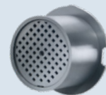
Activated Charcoal Filter Part no.: 988129100