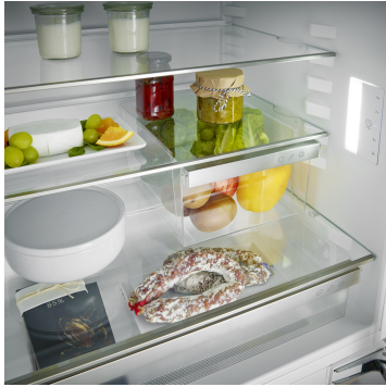
Fruit and Vegetable box

The Fruit and Vegetable box offers a convenient and organized solution for your fresh produce. With its compact yet spacious design, it provides ample room for fruits and vegetables. The transparent construction allows for easy visibility and quick access, while the easy-to-clean surface ensures hassle-free maintenance. Perfect for those who value freshness and organization in their refrigerator.