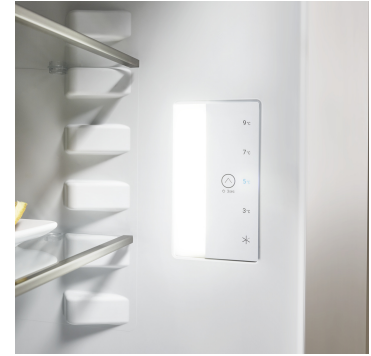
LED light inside

A gentle finger tap and you set your Liebherr to 3, 5, 7 or 9° with TouchControl. So simple – and efficient, as the sleek button is integrated into the interior, creating more space for all your fresh goods.