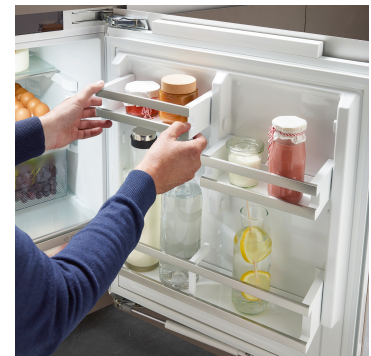
Half Door Racks

The Universalbox makes the perfect home for small food items: Tubes or small cans, for example, can be stored safely and clearly in the bottom drawer. The transparent box not only offers plenty of space but is also easily accessible. And the robust surface is particularly easy to clean – saving time and effort.