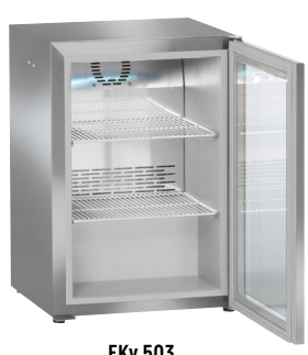
FKv 503 Premium