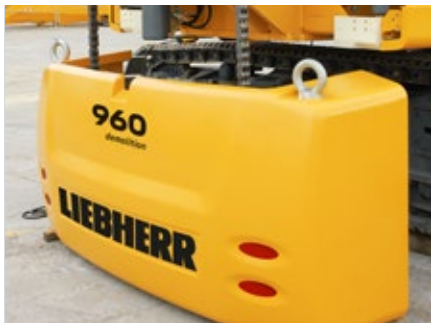
Removable counterweight for easy transportation (optional: hydraulic version)