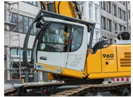
30 degree adjustable cab for better operators view and less operators fatigue