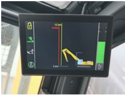
LDC system (Liebherr Demolition Control) monitors the demolition equipment positioning at all times guaranteeing the stability of the high reach