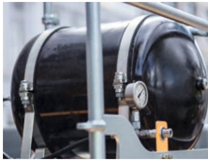
Air compressor for radiator and cabin cleaning (option)