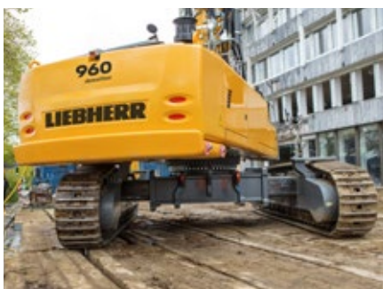
Hydraulically adjustable undercarriage for easy transportation and wider working foot print for stability