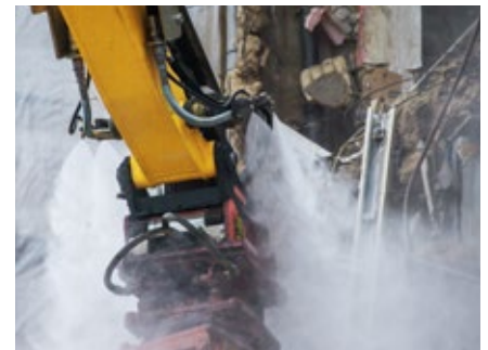
Dust suppression system reduces the amount of dust in the working area