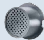
Activated Charcoal Filter Part no.: 3988129100

° = Measurements taken at +25°C ambient and +12°C interior temperature tested by Liebherr Germany (not to Australian standards).